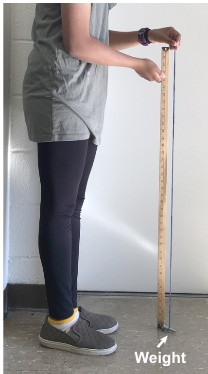
Fig. 2 Plumb Line

A plumb line, made from a piece of string and a weight. One meter was measured from the floor using the plumb line so the measured distance was vertical to the floor.